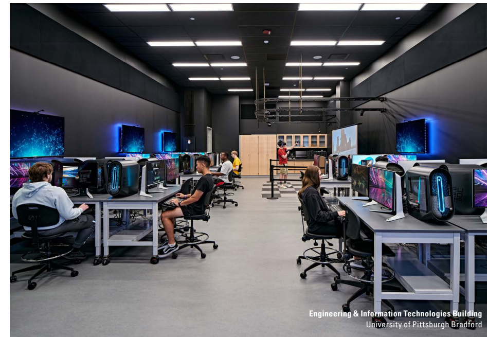
Engineering & Information Technologies Building University of Pittsburgh Bradford

Much like innovative corporate culture, which blends highly creative with technical, universities are embracing the practical side of learning alongside the theoretical. The University of Michigan-Flint and the University of Pittsburgh at Bradford have makerspaces for entrepreneurial projects and product development where students ideate on their own products and potentially partner with researchers to patent them or create businesses.